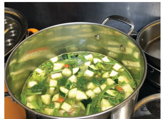
Rosh Hodesh Soup Making