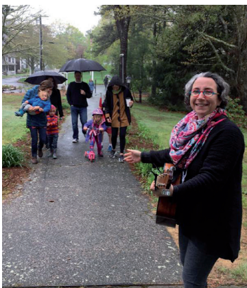
TBZ Community Retreat on Cape Cod