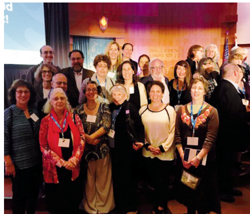
Ruderman Inclusion Project Celebration