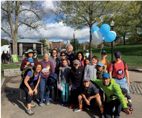
TBZ Participates in the Walk for Hunger