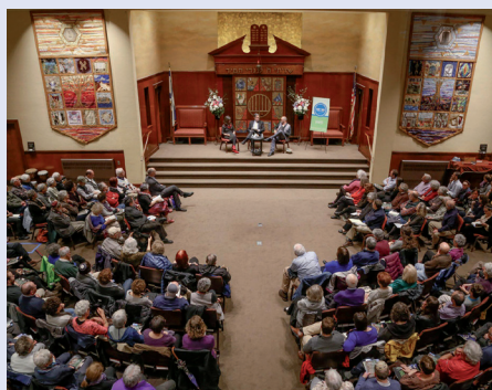
Resilience and Resistance Event: Stories of Survival from the Shoah