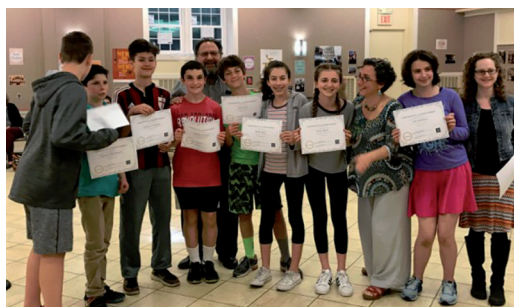
Beit Rabban Graduation in May