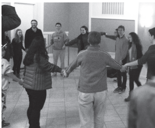
Above: Teen Tu BiShvat Seder, Below: Rosh Hodesh Chanukah Celebration